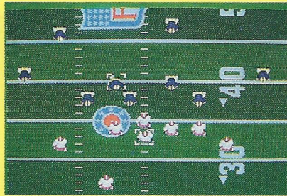
Walter Payton™ Football